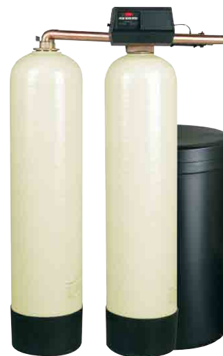
Series PWS15T Twin Alternating