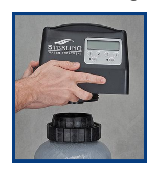
QUICK RELEASE HEAD REMOVAL FOR EASIER REPAIRS