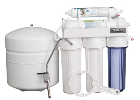
DWSB-TFC-50 5 Stage Reverse Osmosis System 5 Micron Sediment, GAC, Carbon Block,