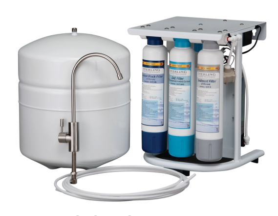
QCRO-50-PUMP 5 Stage Reverse Osmosis System Quiet booster pump increases water pressure to improve water quality and quantity.