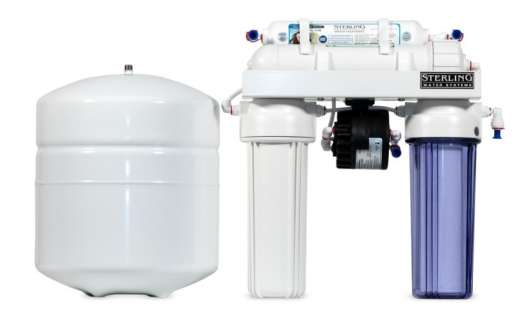
DWSB-50-PermPump 4 Stage Reverse Osmosis System