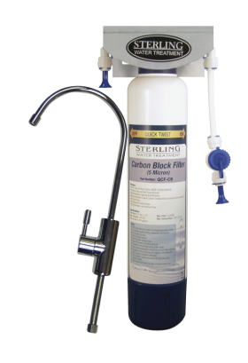
Q1-CB1 Sanitary Quick Change Carbon Block