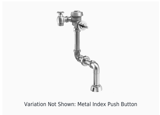
Variation Not Shown: Metal Index Push Button