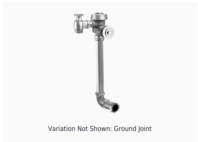
Variation Not Shown: Ground Joint