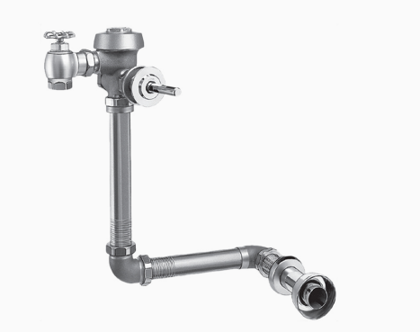
Variations Not Shown: 1" Straight Control Stop and Metal Index Push Button