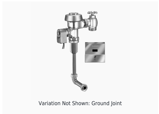
Variation Not Shown: Ground Joint