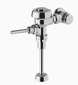
Variation Not Shown: 1.25" Flush Connection