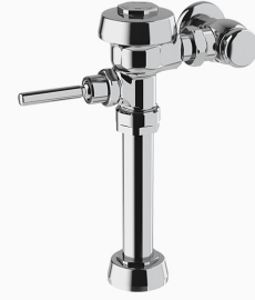
Variation Not Shown: Trap Primer