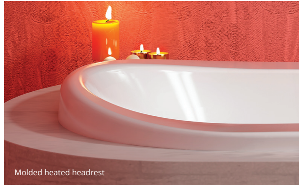
Molded heated headrest