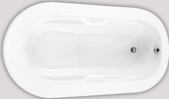
AMMA OVAL 6638