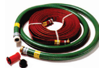
02S5HK 2" High Pressure Hose Kit

NOTE: Dimensions are in inches and have a tolerance of \pm 1/8" .