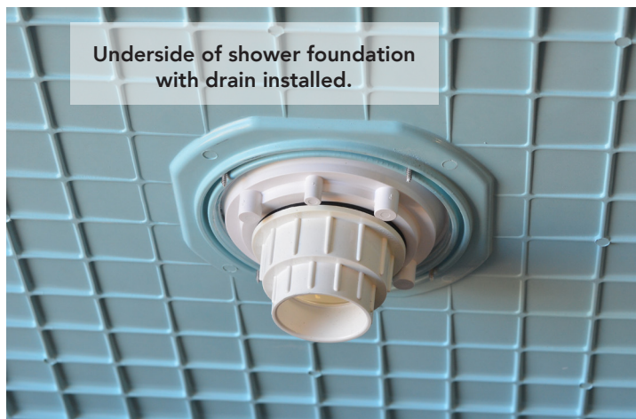
Underside of shower foundation with drain installed.