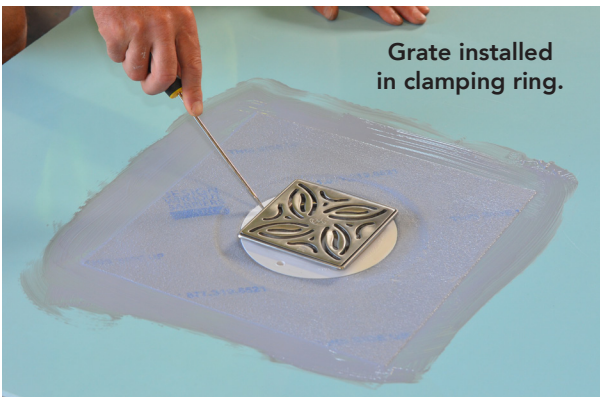
Grate installed in clamping ring.