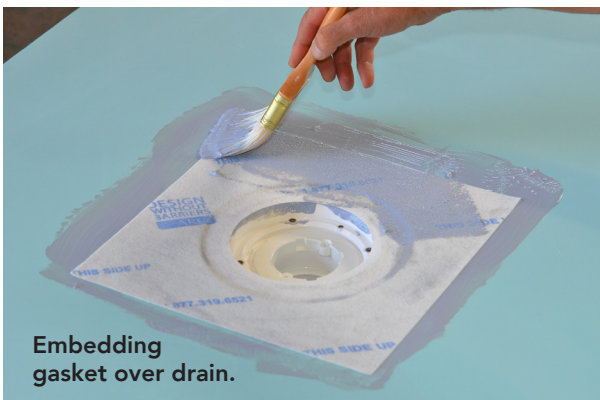
Embedding gasket over drain.