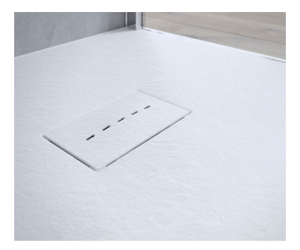
Drain cover detail.