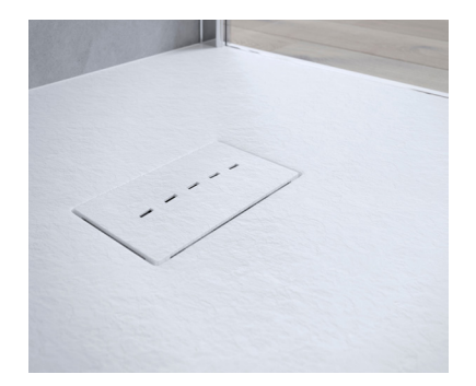
Drain cover detail.